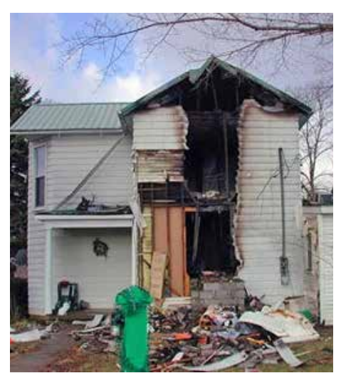
Sample photo of chimney fire damage.

If your chimney is clean, there will not be a fire; therefore, regular inspections and cleanings are necessary to ensure you and your home have a safe and happy winter season.