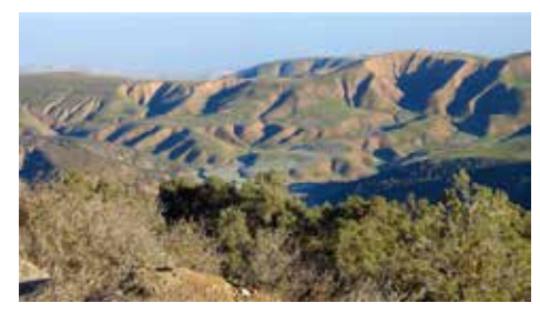
Fig. 7: Santiago Creek passes through the private Wind Wolves Preserve.

excellent. There are no public facilities on this stretch, and the weather and road conditions can vary greatly. Enjoy!