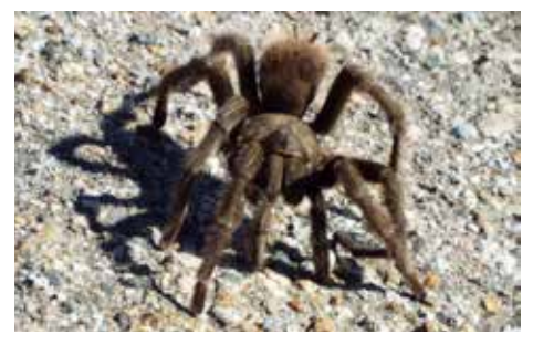
Fig. 9: In October, male tarantulas can be seen on the road searching for females.