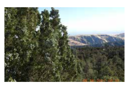
Fig. 3: This berry-laden juniper creates food and shelter for a variety of wildlife.

thick stands of Pinyon Pine (Fig. 2), juniper (Fig. 3) and various shrubs. The California scrub-jay (Fig. 4) is at home here. The views