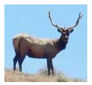
Fig. 1: Tule elk have been reintroduced to nearby Wind Wolves Preserve, and are expanding their range.

Just west of Pine Mountain Club there exists a rural road that displays some of the splendor and wildness of California that