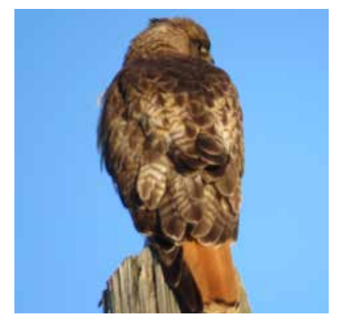
Fig. 10: This red-tailed hawk may be looking for small rodents.