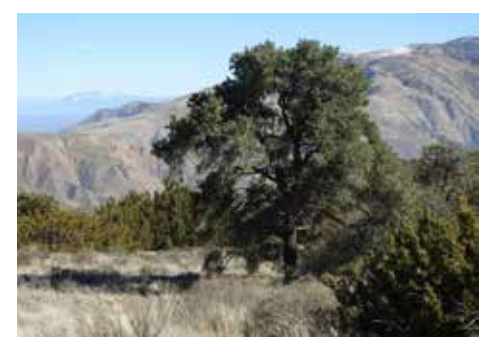
Fig. 2: The single-leaf pinyon is the most common conifer in the scrub woodlands.

ing slowly and stopping at some of the unmarked pull-outs along the way. This bull tule elk surveys its hilly terrain (Fig. 1, on page 1).