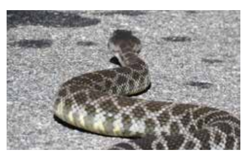
Fig. 8: If possible, avoid driving over any snakes. They all are important inhabitants.