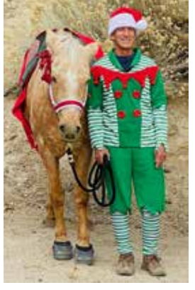
Among the holiday festivities in PMC were the annual tree lighting and craft fair, Breakfast with Santa and Christmas in the Village/Parade.