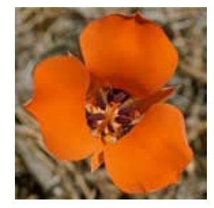
Figure 10: Kennedy's mariposa lily

Figure 11: Common varrow/ Southern scarlet penstemon