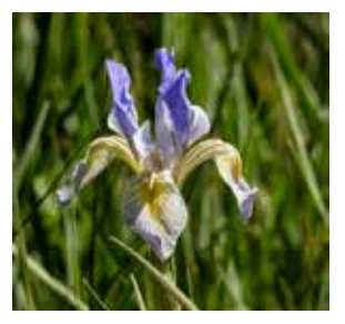
Figure 1: Western blue flag (iris)

Spring and summer come later on the peaks and ridges above PMC than down here in our village. Residences in PMC range from 4,900' to 6,400' in elevation. San Emigdio Mountain to the north of us rises to a little over 7,000'. Immediately to the south of our community are several peaks over 8,000', with Mt. Pinos being almost 9,000'. July is a good time to visit the higher country for flowers and other outdoor enjoyments. Two paved