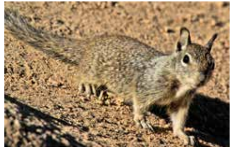
Fig. 5: The California ground squirrel is comfortable underground, on the ground or above ground (RC)