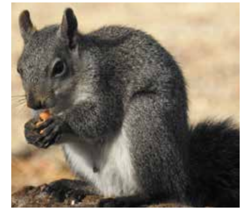
Fig. 6: The western gray squirrel will feed on the ground (unknown)

have the western gray squirrel (Fig. 6). This energetic climber is mostly arboreal. It is comfortable passing from tree to tree on branches (Fig. 7). When on the ground, it appears nervous and uncertain. It will feed on a variety of plant foods, but loves acorns, fruit and nuts, and fungi. Jim Lowery, a local author, teacher and tracker, has written a marvelous book called Tracker's Field Guide, available at Adventure Ink in PMC. In his section on the western gray squirrel, Jim describes the regular trav-