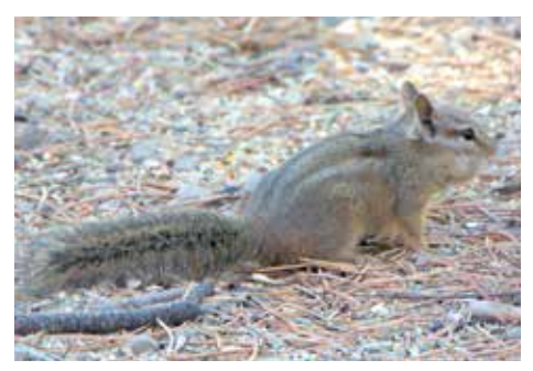
Fig. 8: The Merriam's chipmunk and its long flexible tail (RC)

ally are two species of chipmunks in our mountains. The common one is Merriam's chipmunk (Fig. 8). High on our mountain tops is a relic population of the Mt. Pinos chipmunk. This species in found only on a few mountains in Southern California.