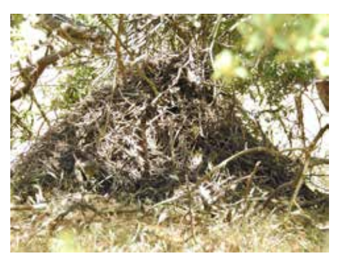
Fig. 9: This large nest mound often houses just one wood rat (LB)

Rodents, as a group, have been very successful at thriving in many types of environments, including subterranean, surface ground, logs, bushes and tree canopies. They have been in these mountains long before we arrived. They attempt to fit us into their life patterns (whether we like it or not).