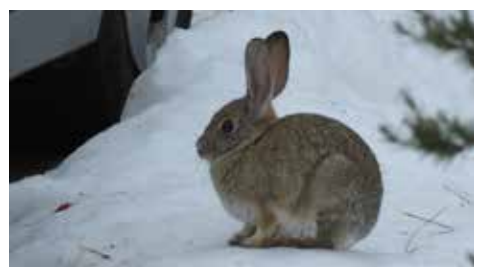
Fig. 2: Desert cottontail staying close to a vehicle for safety (BB)

their worlds. Each species has reacted to our presence in a distinct fashion. Starting with rabbits, we have two species up here. The black-tailed hare (jackrabbit) is not common in our forests, but is regularly found in open areas, such as along the Hudson Ranch Road west of us. The hare is vegetarian. Its life is spent entire-