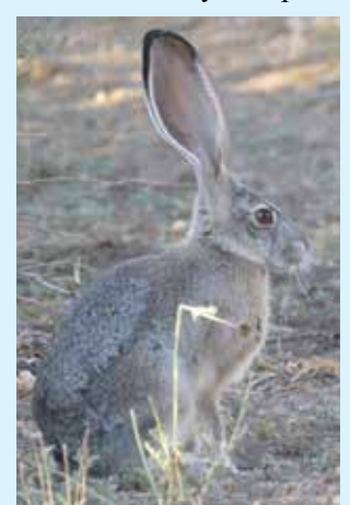
Fig. 1: Black-tailed hare with its very long ears (BB)

I don't need to say we have both rabbits and rodents up here in Pine Mountain Club. The cute little bunnies (cottontails) aren't as cute when they nibble on the baby vegetables. Gophers tend to plow up our yards, whether we want them plowed up or not. California ground squirrels are eating and digging machines. Tree squirrels are generally good neighbors, unless we try to feed the birds; then they get pushy. Chipmunks generally stay out of trouble with us humans. Mice seem to be able to get into any little nook or cranny. And, of course, they love human food and human-made materials for their nest-building. Then there are the wood rats! It seems like everyone up here has a wood rat story or two: "It