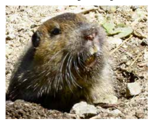
Fig. 3: The Botta's pocket gopher is strictly subterranean (LB)

ly on the surface of the land (Fig. 1, on page 1). It does not burrow and will not climb brush or trees. The little desert cottontail (Fig. 2) is our most common rabbit. It also lives on the ground, rarely burrowing. The cottontail feeds on many kinds of plants. Both the hare and the cottontail are major diet components of several carnivorous mammals, such as wildcats, coyotes, red-tailed hawks and golden eagles. Once,